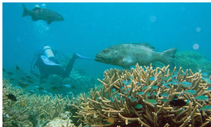
A coral community in the marine protected area at Heron Island, southern Great Barrier Reef.