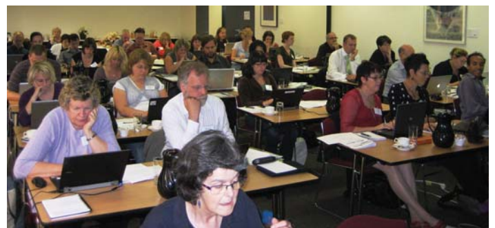
Participants at work at the Gumboots for Deluge Workshop held on February 12 in Melbourne

The workshop was offered again in Sydney on April 21. See the ANDS website for forthcoming event details.