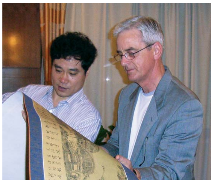
Professor Rudi Appels and a colleague in China examining a copy of an old scroll, 2 metres long, that described the details of village life through images that provided an integration of the jobs people carried out, the crops grown, the equipment used and the structures of facilities. The modern version of the scroll is the internet.

"The Federal Government, State Government and growers have been interacting with groups in the Asian region, including China, but when we look around there are huge areas for improvement for the data integration on wheat," he said.